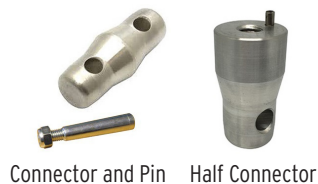
Connector and Pin Half Connector

Required to link each of the modular components. Tapered pins are supplied with each module, but spares also available. The half connector has an M12 internal thread for attachment via a bolt to a clamp or eye of your choice. We can supply a wide range of these connectors, see our website for further details. The Doughty Clamp version listed here has a SWL of 100 kg and weighs just 780 g.